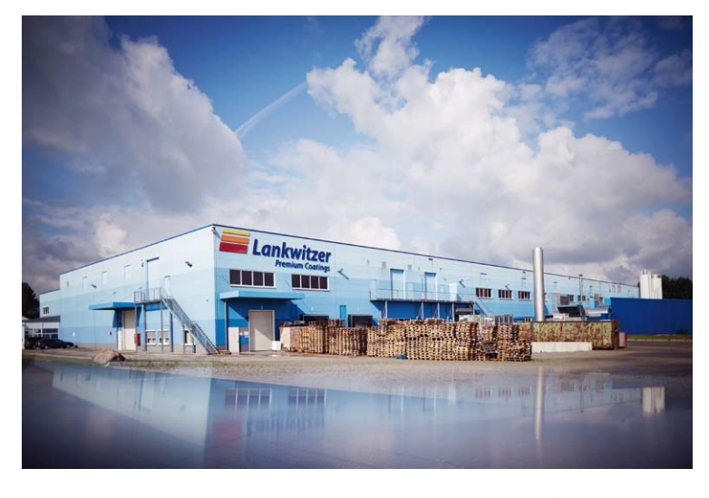
Lankwitzer Lackfabrik GmbH