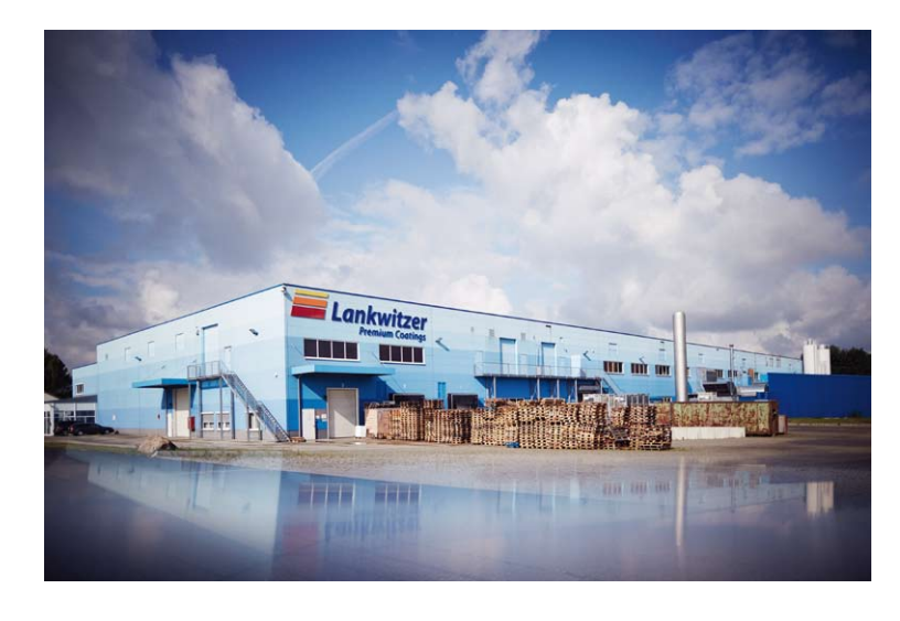
Lankwitzer Lackfabrik GmbH