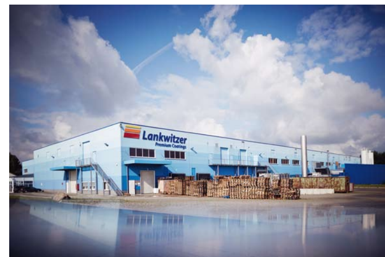
Lankwitzer Lackfabrik GmbH