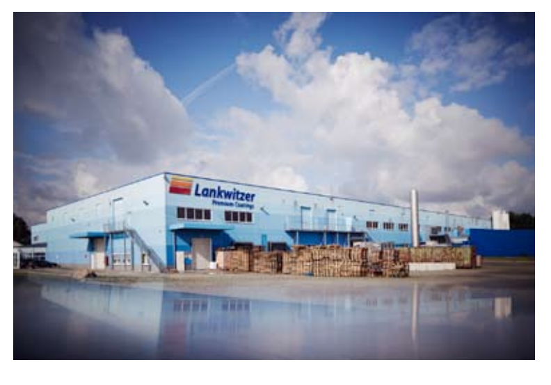
Lankwitzer Lackfabrik GmbH